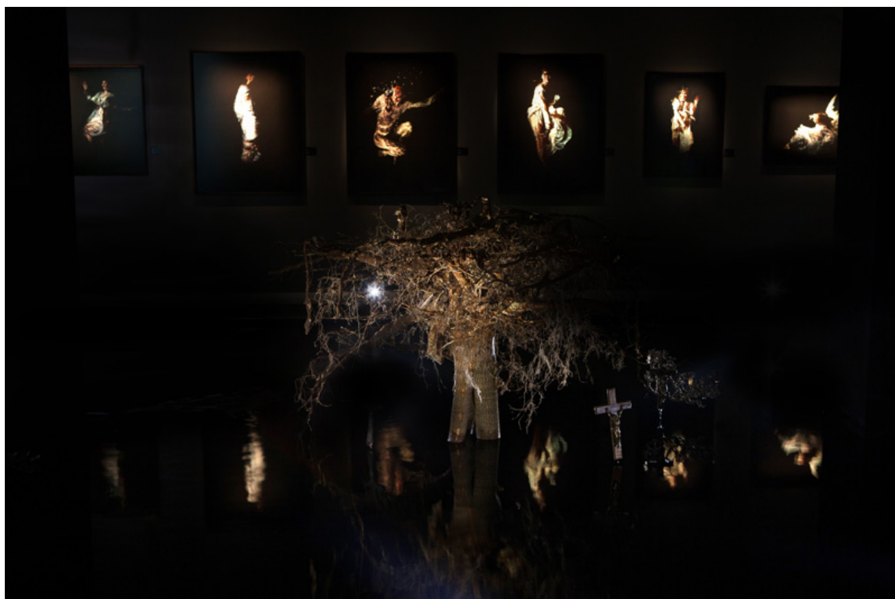
' Floating Cemetery ' black water installation for the exhibition ' Rastvorennaya Pehcal '; Moscow 2014