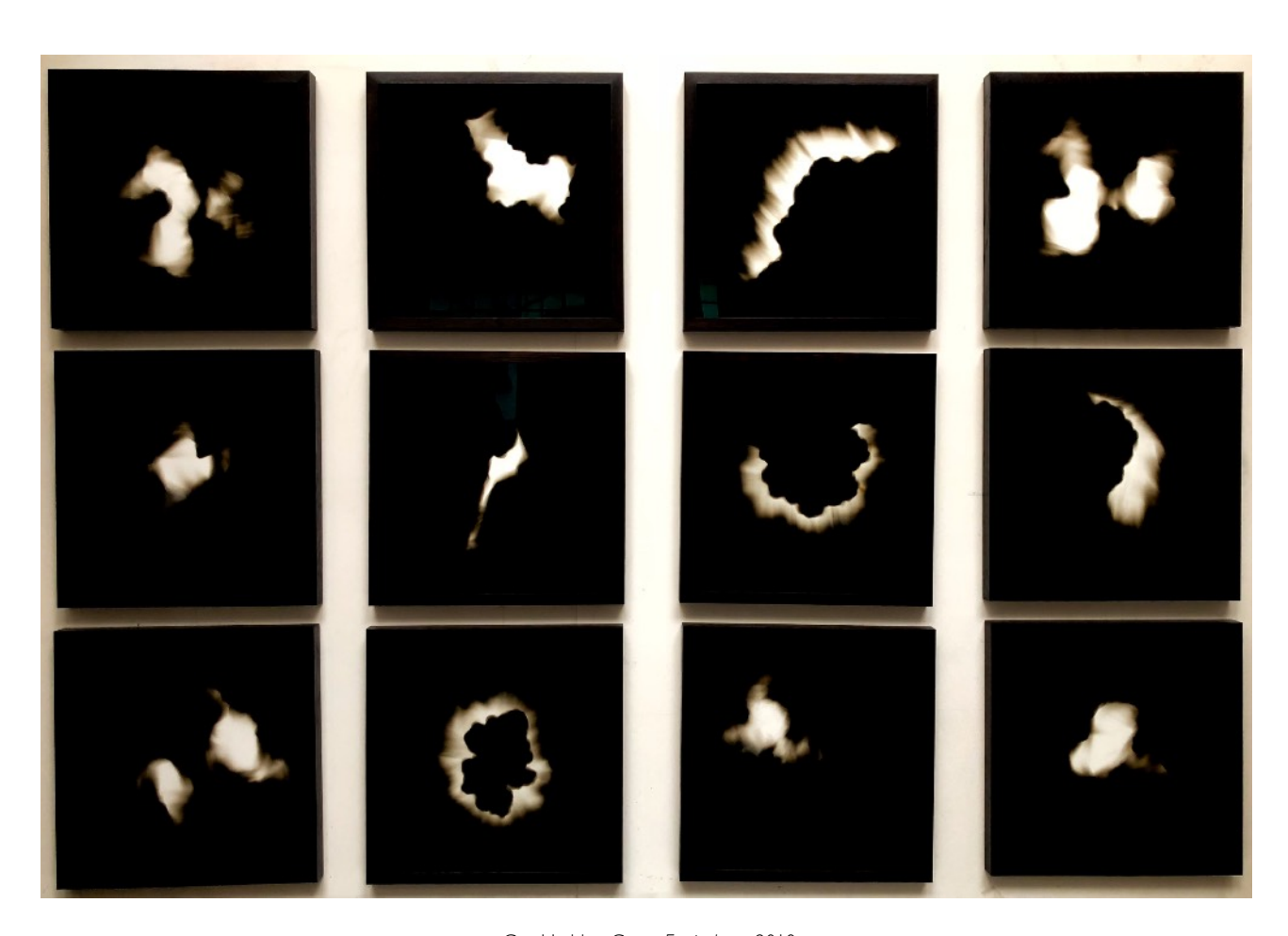
Guy Haddon Grant, Equivalents, 2018 Candle soot on paper, 35 \times 35 cm each