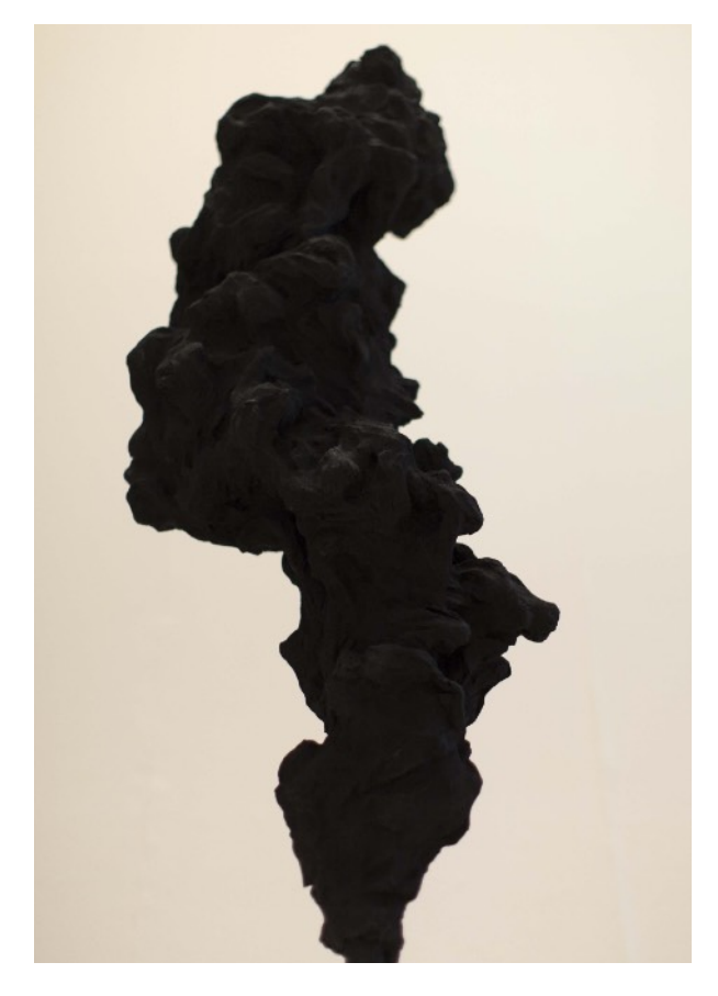
Guy Haddon Grant, Cloud Totem, 2017-18

Dellasposa is honoured to present 'Ashes', the gallery's first exhibition dedicated to one of Britain's most important young sculptors, Guy Haddon Grant – described by a leading critic as an 'inventive' sculptor who is leaving behind established authorities within the contemporary art world.